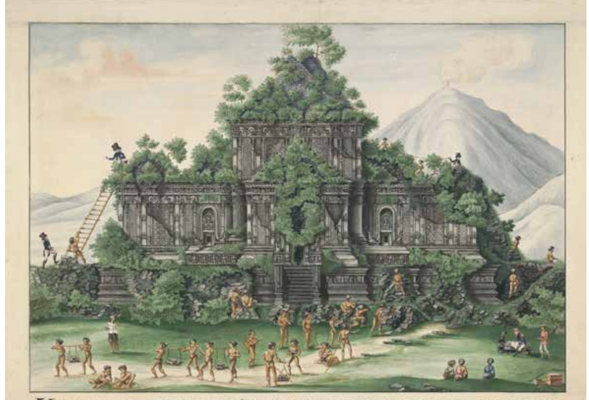
VIEW OF THE RUINS, OF A, BRAMINTEMPLE, AT BRAMBANANC, ASFORMD IN THE JAAR 3807,

H.C. Cornelius, View of the ruins of a Brahmin Temple at Brambanan, 1807. Image AN590585001.