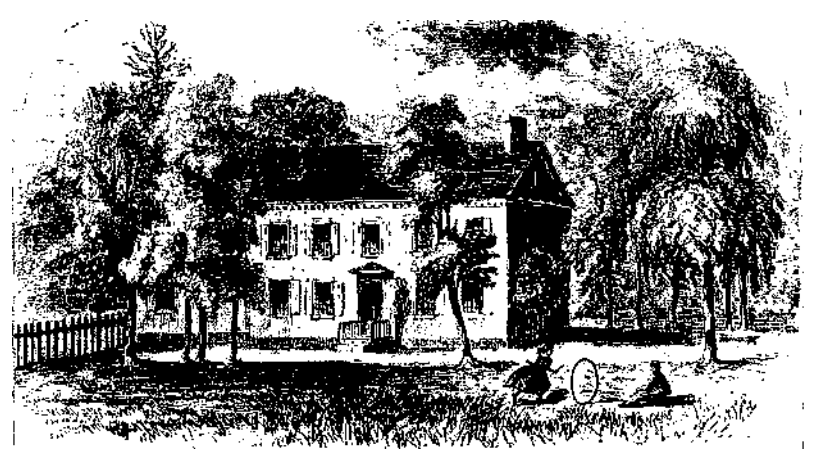
THE FICEL1.\'GHUY8EK ÏIOMESÏEAU

(TOP) The Repeal, or The Funeral of Miss Ame-Stamp—pro-American cartoon on the repeal of the Stamp Act, issued in London and Philadelphia. Typical of the shift from anti-Catholic to anti-Anglican sentiment