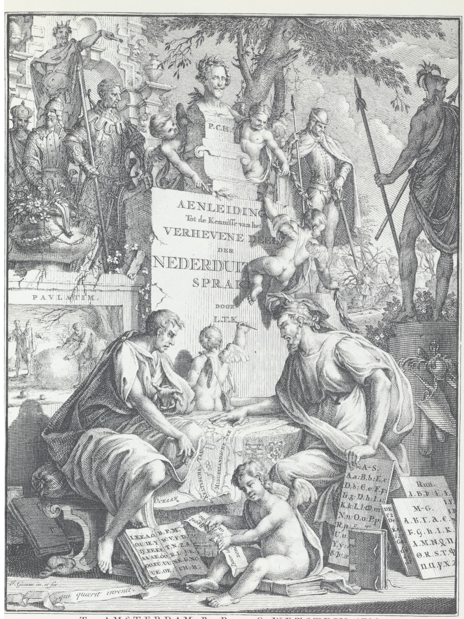
Te AMSTERDAM By R. en G. WETSTEIN. 1723

Picture in Ten Kate's Aenleiding , ed. by Noordegraaf and Van der Wal (Amsterdam 2001 [1723]) vol. 1. The maker of the illustration is unknown.