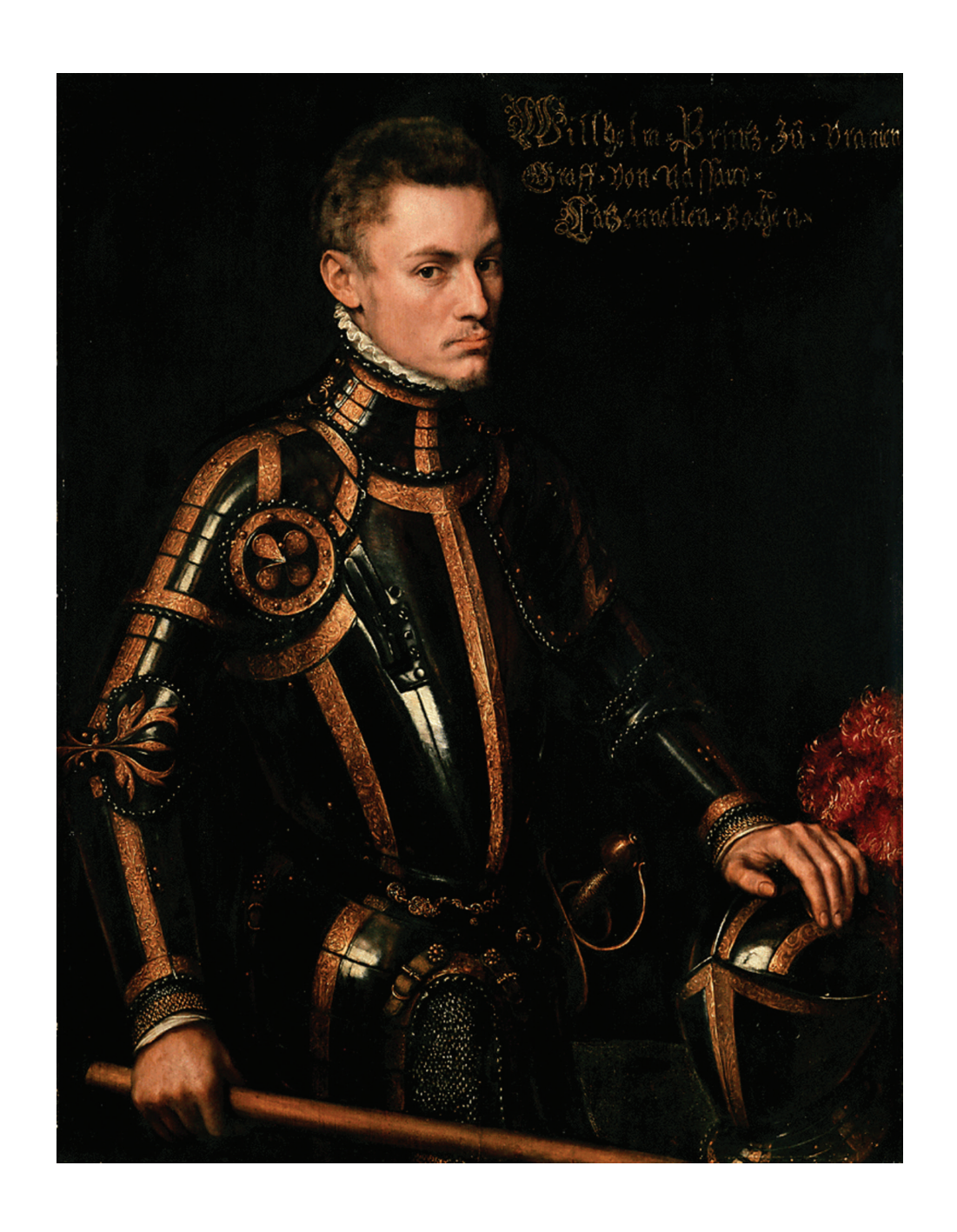
Anthonis Mor, Portrait of William of Orange , 1555.