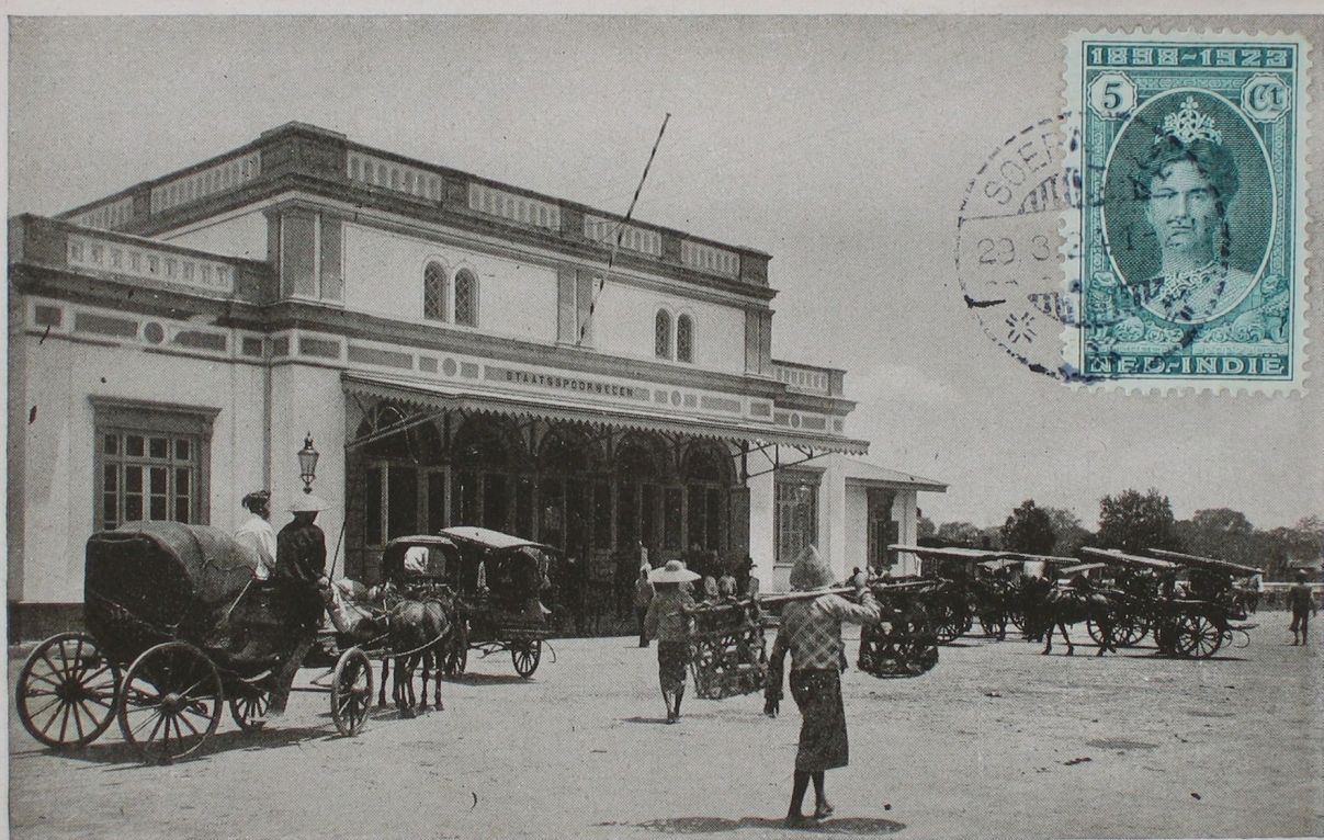
SOERABAJA, Station S.S.