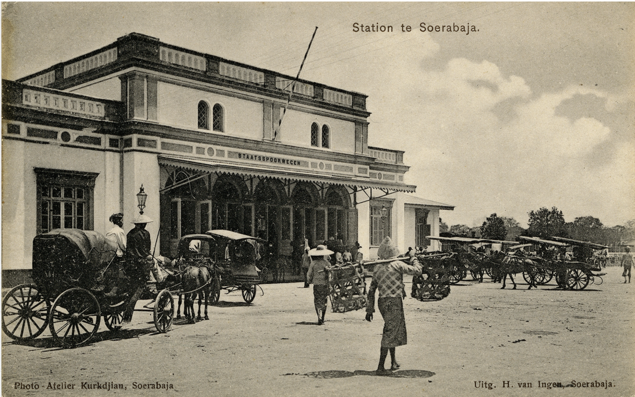
Station te Soerabaja.