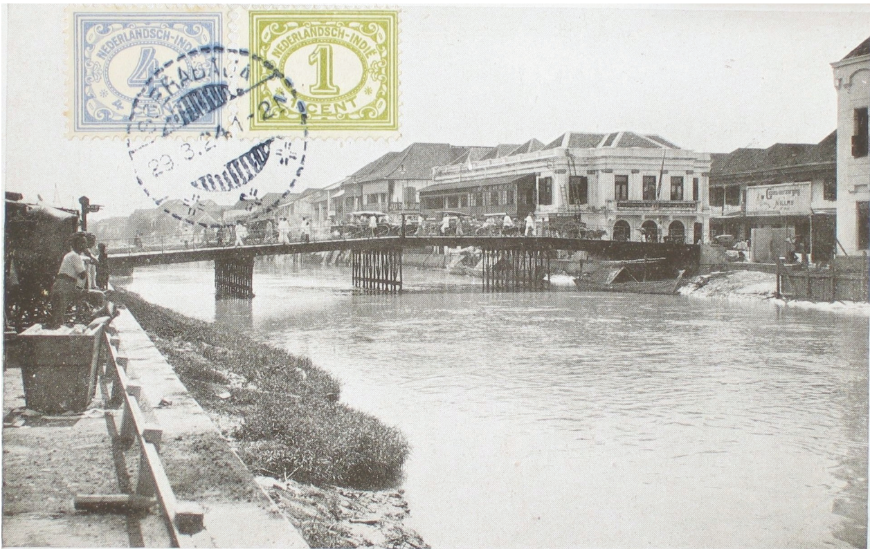
SOERABAJA, Roode Brug